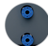
Large connections for professional swimming pools