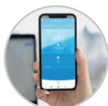
WiFi Connection for remote monitoring