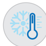
Large operating range up to -15°C