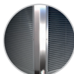
Anticorrosion stainless steel structure