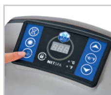
Removable motor block Automatic temperature control.