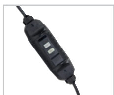
Secured plug 10 mA 100% safe against electrical hazards. Integrates a differential circuit breaker 10 mA.