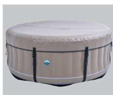
Secured & isothermal cover Laminated PVC with insulating aluminium sheet.