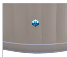
Ultra-resistant & design structure Exclusive design with textured finish.